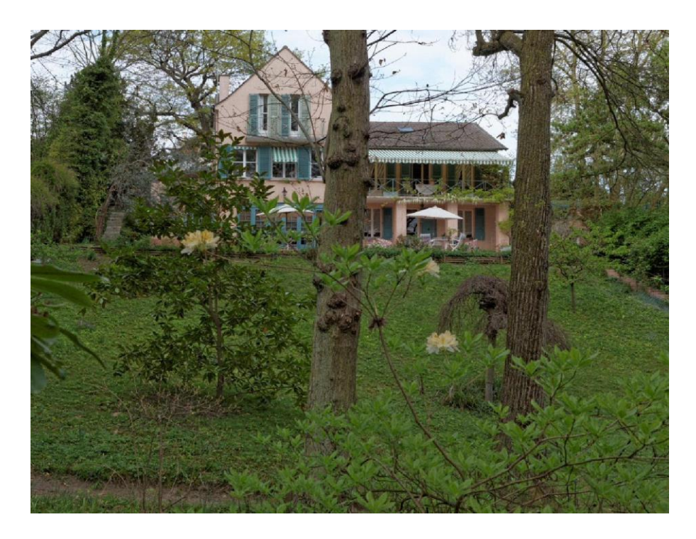
Les vallons de l'Ermitage

The Ermitage Foundation, created by Martine Renaud- Boulart, sponsored by the Ministry of Culture, was inaugurated by Jack Lang in 2014 in the historical house "Vallons de l'Ermitage".